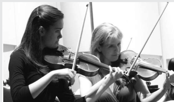
Youth Symphony musicians play alongside Phoenix Symphony musicians.